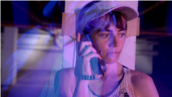
Liv Schulman, Brown, Yellow, White and Dead Dead , Episode 1. Detail capture

Liv Schulman's films hijack television codes to engage in a biting analysis of traditional representations of gender and identity. Far from locking herself into scholarly postures, the artist prefers to play with irony and the absurd in order to better undermine all the clichés.